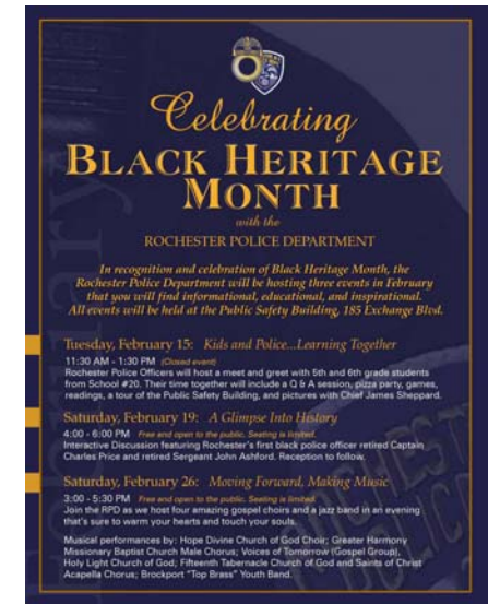
of who performed:

RPD Concert Event- Attendance was Standing Room Only. Below is a list